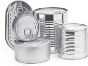
CANS Aluminum and steel