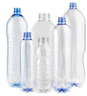
PLASTIC Bottles and jugs (#1, #2, #5)